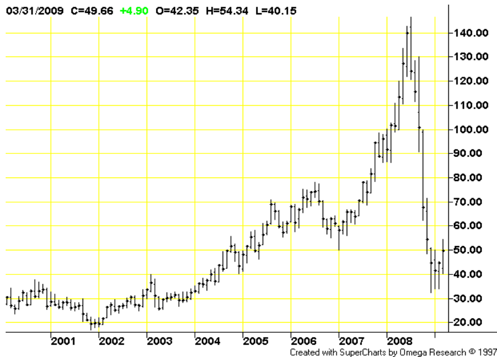
Crude Oil Prices This Decade

One bubble is bad enough. But the Fed's response to the housing collapse is illustrative of the way in which one poor policy can be borne of another. The economy weakened as housing prices stagnated then fell and the Fed again slashed interest rates as a stimulative measure. At this point the crisis seemed quarantined in the U.S. and the dollar fell to historic lows against other currencies. Because commodities are priced in dollars, by definition, they must rise in price when the dollar weakens. In less than a year (August 2007 – July 2008), the price of oil more than doubled from $70 to $147. The roller coaster ride, though, was just beginning. As the financial contagion spread to other economies, the dollar strengthened in a flight to the safety of U.S. Treasuries. By October 2008, the price of oil crashed to where it began 14 months prior and it has continued down to a recent trading range in the $40s.